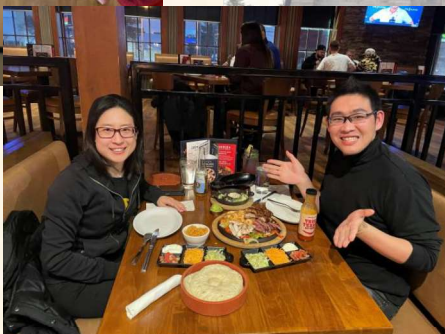
The Senior who facilitated the visit to OVC

To conclude, being a part of the WISE program was an encounter and offer of a lifetime, which have marked as a turning point in my life as a clinician. I will soon be beginning my journey as a rotating intern in small animal medicine at the Western College of Veterinary Medicine, Saskatchewan, and hopefully I will be able to match with a residency program in Veterinary Internal Medicine.