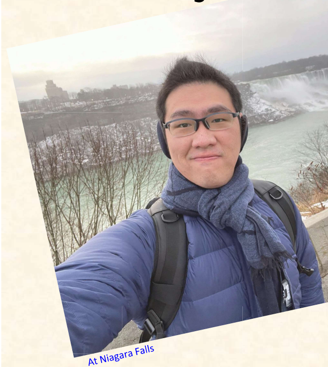
At Niagara Falls

The most valuable experiences that the WISE program has offered were the different modules and the international internship. While module 1 and 2 focused more on academic skills cultivation such as One Health seminar and debate, module 3 and 4 provided platforms for graduate students to hone transferable skills with collaborative local and international organizations. One of the striking experiences which I enjoyed the most was through module 4, where graduate students get to design an activity which involved international collaborators to hone our One Health skill sets. Our group had the chance to visit the Translational Medical Institute and Veterinary Teaching School of Colorado State University, where we get to see and visit the best institutes for One Health research and clinical practice in North America.