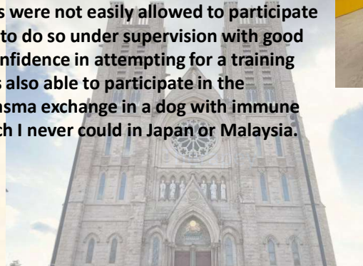
Basilica of Our Lady Immaculate in Guelph