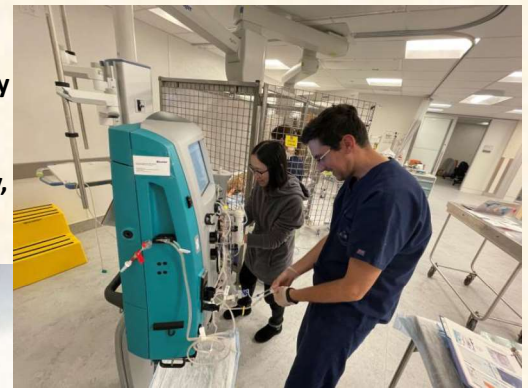
Therapeutic Plasma Exchange

Apart from the modules, the WISE program too has offered the opportunity for graduate students to embark on internships to the institute of their choices, where I was honored to visit Ontario Veterinary College in Guelph, Canada. This was by far my most valuable experience the WISE program has provided, as I get to experience the life of an intern and resident in various services such as internal medicine, surgery, emergency & critical care, neurology and cardiology; further strengthening my resolution in pursuing a board certification training in North America. Although visitors were not easily allowed to participate in handling cases, I was allowed to do so under supervision with good faith, which have boosted my confidence in attempting for a training program in North America. I was also able to participate in the preparation for a therapeutic plasma exchange in a dog with immune mediate hemolytic anemia, which I never could in Japan or Malaysia.