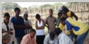
Heavy metal pollution of fish (Ethiopia)

4. Experience of the One Health approach through practical surveys and joint research overseas