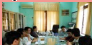
Conference on bird flu control (FAO Vietnam)

3. Cultivation of an ability to collaborate through participation in joint research and support for conferences by international administrative organizations