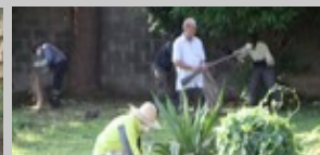
Survey on filovirus in bats (Zambia)

3. Cultivation of an ability to collaborate through participation in joint research and support for conferences by international administrative organizations