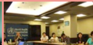
Survey on infectious diseases (WHO Philippines)

2. Development of universal ability, including explanation and debate capabilities, through group work for problem-solving and policy planning